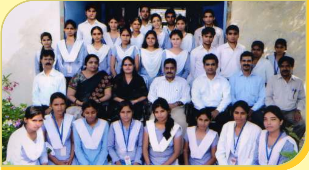
RELIANCE CAMPUS INTERVIEW