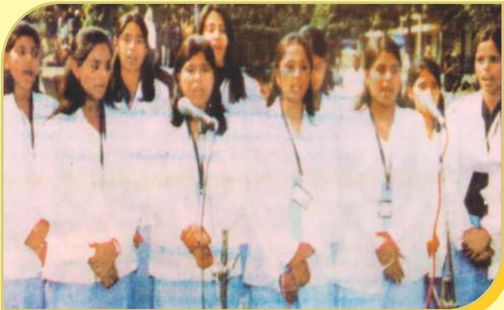
STUDENTS PERFORMING AT REPUBLIC DAY