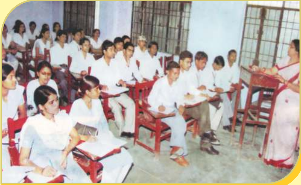
LECTURE ROOM OF OPTOMETRY