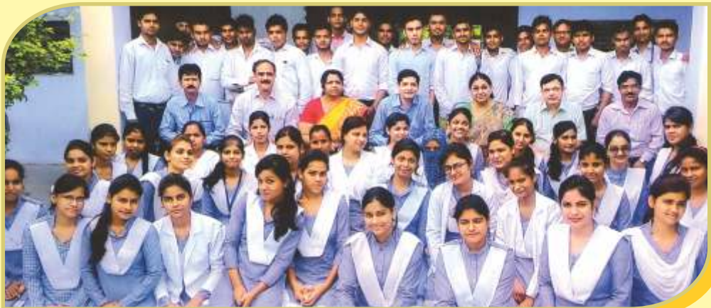
TITAN CAMPUS PLACEMENT