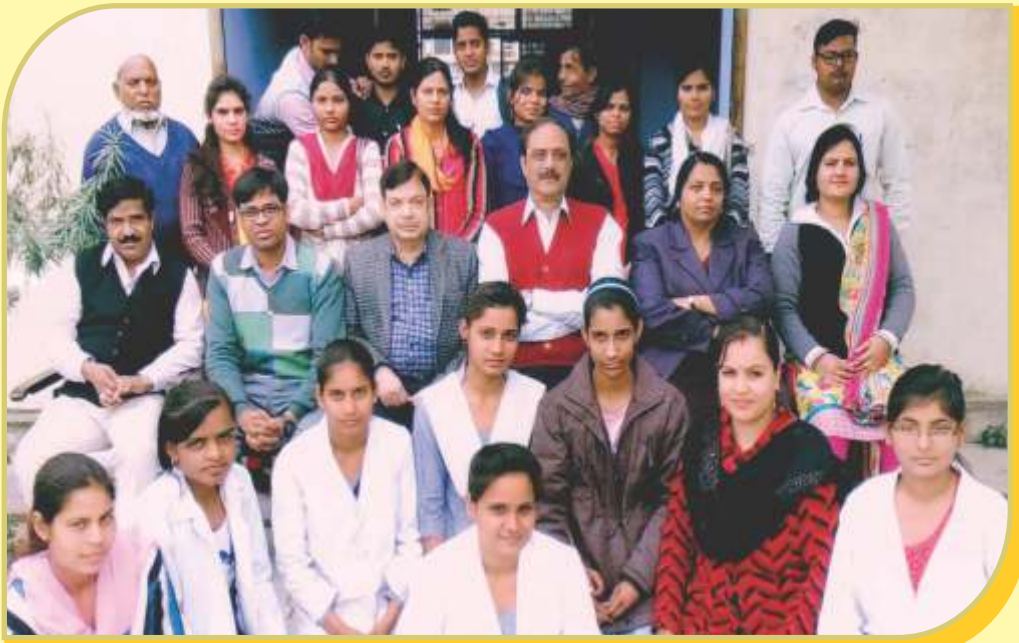
B. ABLE CAMPUS PLACEMENT