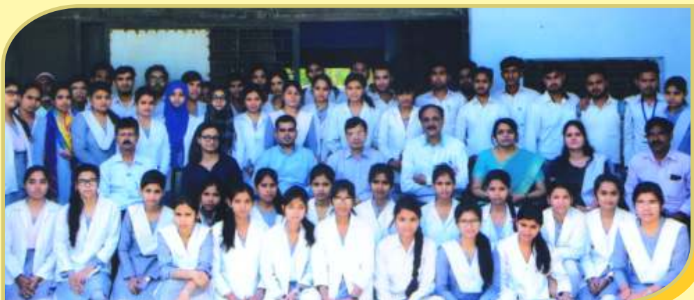
TITAN CAMPUS PLACEMENT