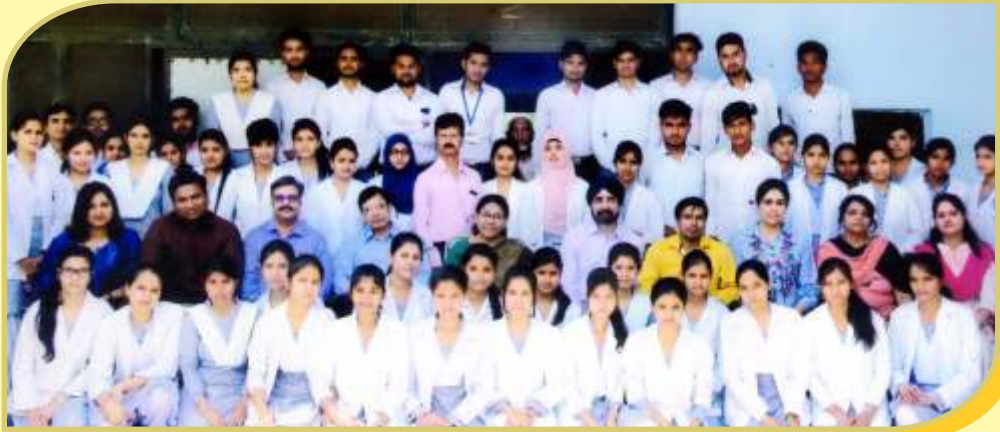
LENS KART CAMPUS INTERVIEW