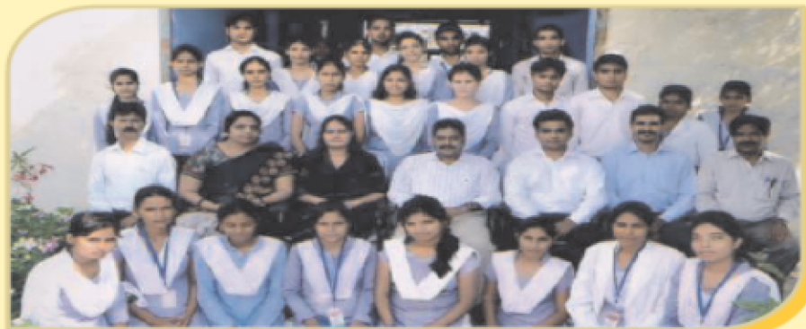
RELIANCE CAMPUS INTERVIEW