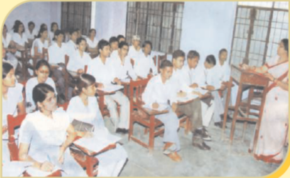
LECTURE ROOM OF OPTOMETRY