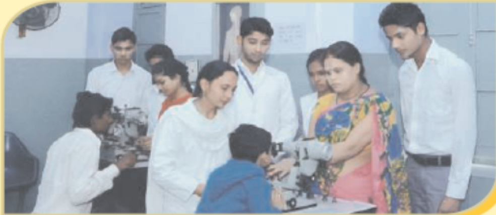
ओर्थोप्टिक्स विभाग में सिनेण्टोफोर पर प्रशिक्षण प्राप्त करते विद्यार्थी